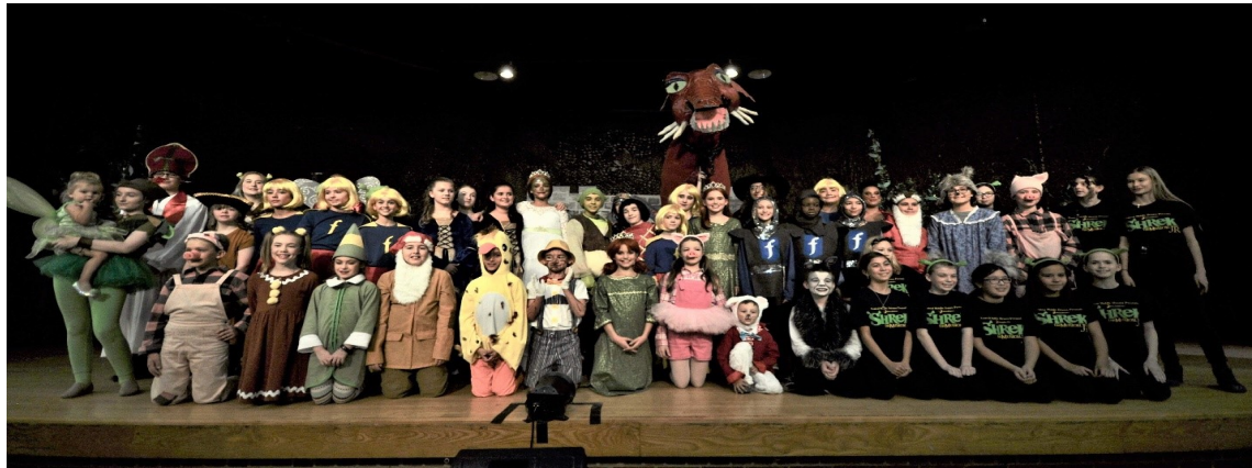
Pictured above is the cast and crew of the Shrek the Musical